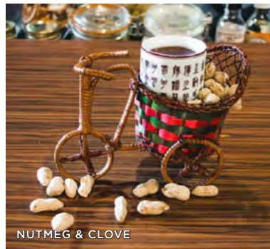
NUTMEG & CLOVE